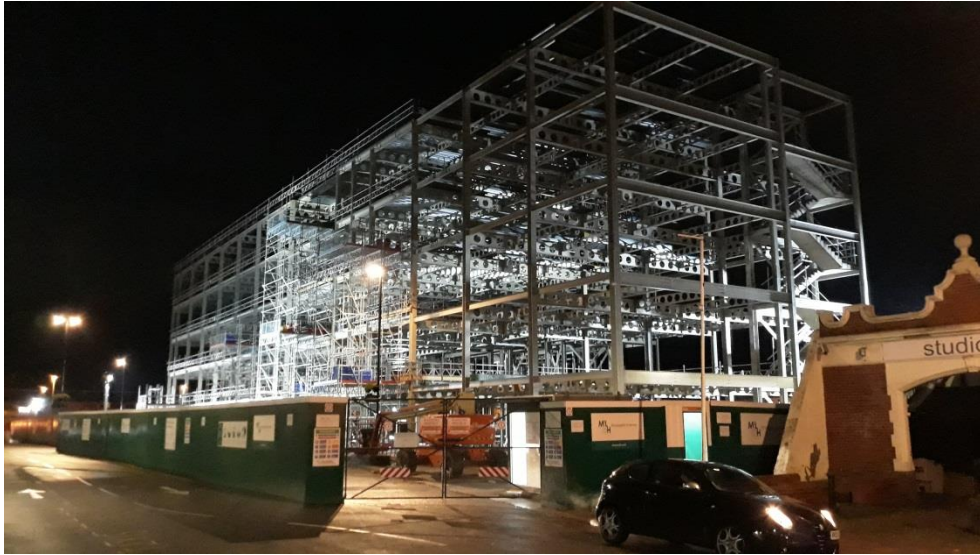
Teville Gate House construction, December 2019